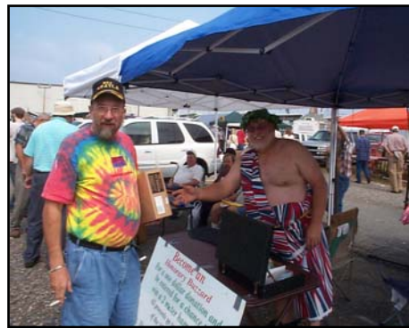
KF4TLA accepting the Yaesu 2800

for the victor. All who were present were spared any public display of affection and embarrassing predicaments that could have arose.