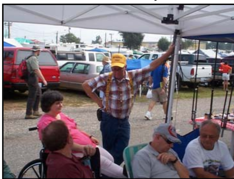
KF4ZCC wearing the yellow "crown"

Amidst implications of repeater sabotage (sometimes the 145.190 machine on Mt. Mitchell had a quick timeout), to rumors of outright influence peddling/buying, a conclusion was finally reached.