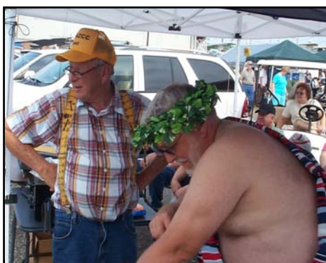
KE4VXC wearing the "wreath"

paraded amidst the admiring throngs and into the splendid temple erected just to commemorate his historic accomplishment.