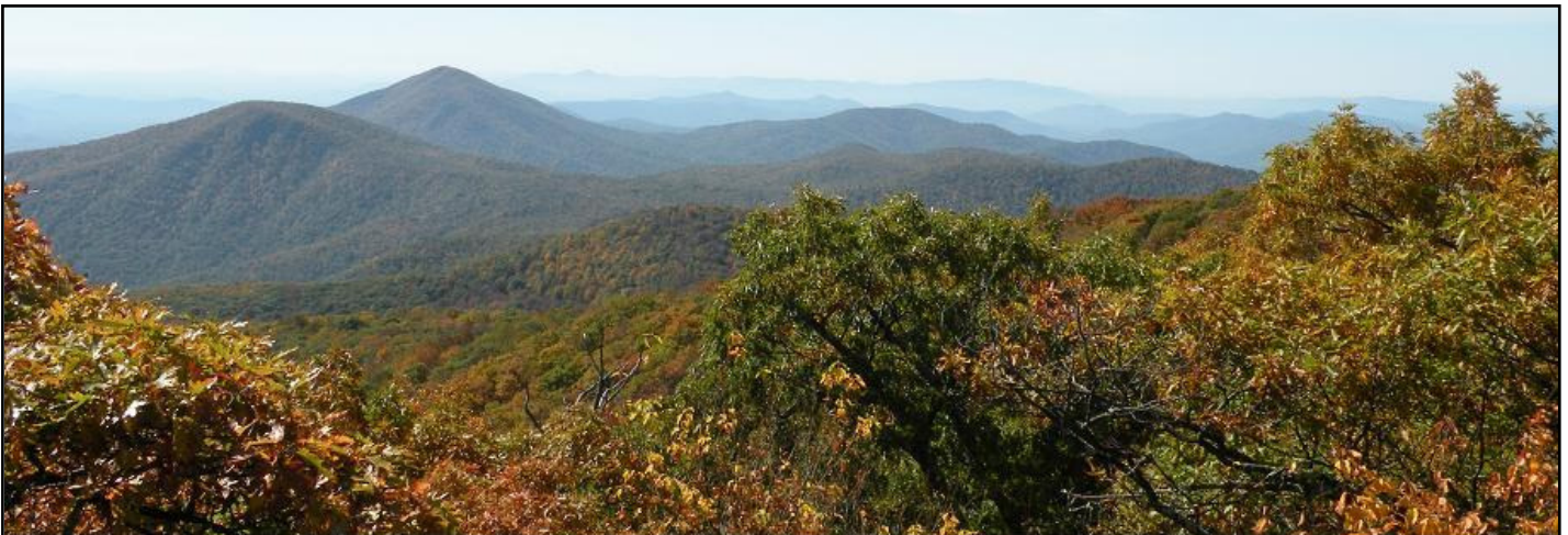
Photo from W4WWQ shows Sharp Top Mountain on the BR parkway at 221 deg from Apple Orchard Mountain. Roanoke's Poor Mtn is near center.